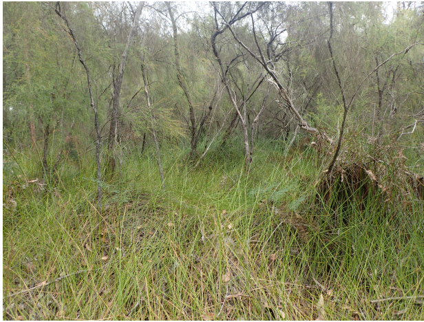
Figure 3: Wetland vegetation within application area