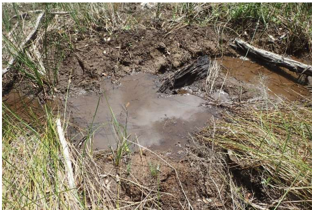
Figure 7: Creekline and soil type

The sunset frog ( Spicospina flammocaerulea ) is recorded in association with peaty soils; the site inspection identified the potential for peaty soils in the areas of sedgeland and noted other amphibians during the inspection (TSSC, 2019; Figure 7, Figure 8). Advice received from DBCA indicate that the habitat is not likely suitable for the species, with different flora assemblages note in suitable habitat (DBCA, 2020).