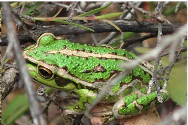
Figure 8: Amphibians noted during site inspection

A total of 36 trees were recorded within the application area during the site inspection undertaken by DWER. The vast majority of these were Corymbia calophylla (marri), with some Eucalyptus marginata (jarrah) and an Allocasuarina sp. (sheoak) also recorded (DWER, 2020a). Threatened black cockatoos (Baudin's cockatoo ( Calyptorhynchus baudinii ), Carnaby's cockatoo ( Calyptorhynchus latirostris ) and forest red-tailed black cockatoo ( Calyptorhynchus banksii naso )) typically utilise marri trees for foraging, particularly Baudin's and forest red-tailed black cockatoos whose primary food source is marri seeds and flowers (DEE, 2013). None of the trees recorded a diameter at breast height over 500 millimetres indicating that the trees proposed to be cleared