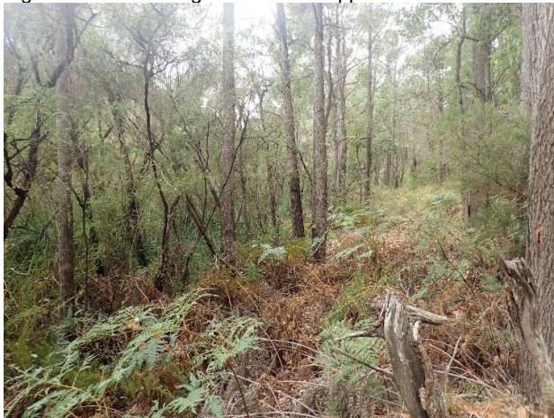
Figure 5: Fringing Marri vegetation within application area