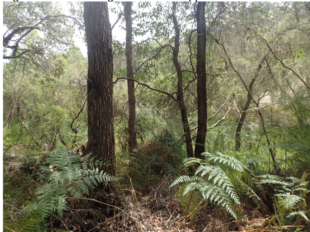
Figure 6: Fringing Marri vegetation within application area