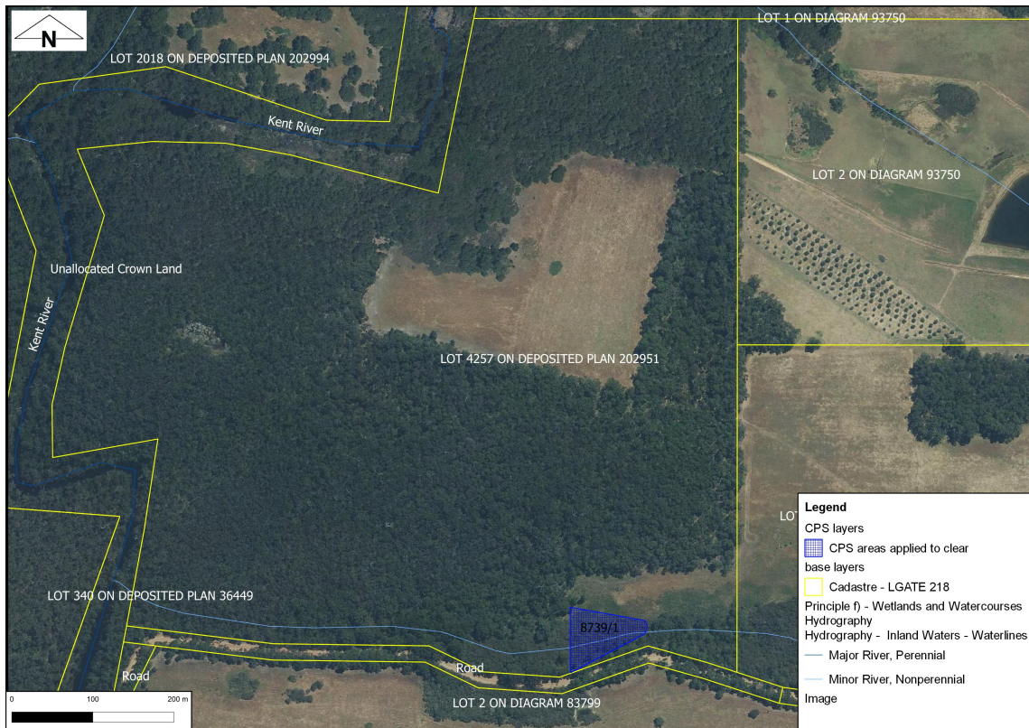
Figure 2: application area in context of Lot 4257 and Kent River