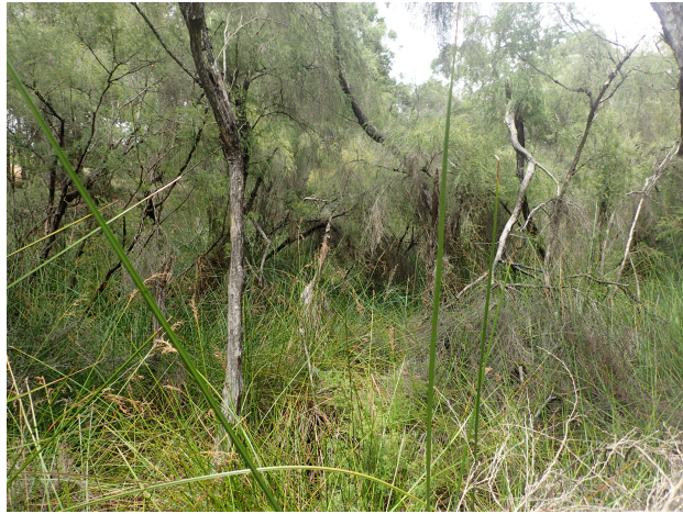
Figure 4: Wetland vegetation within application area