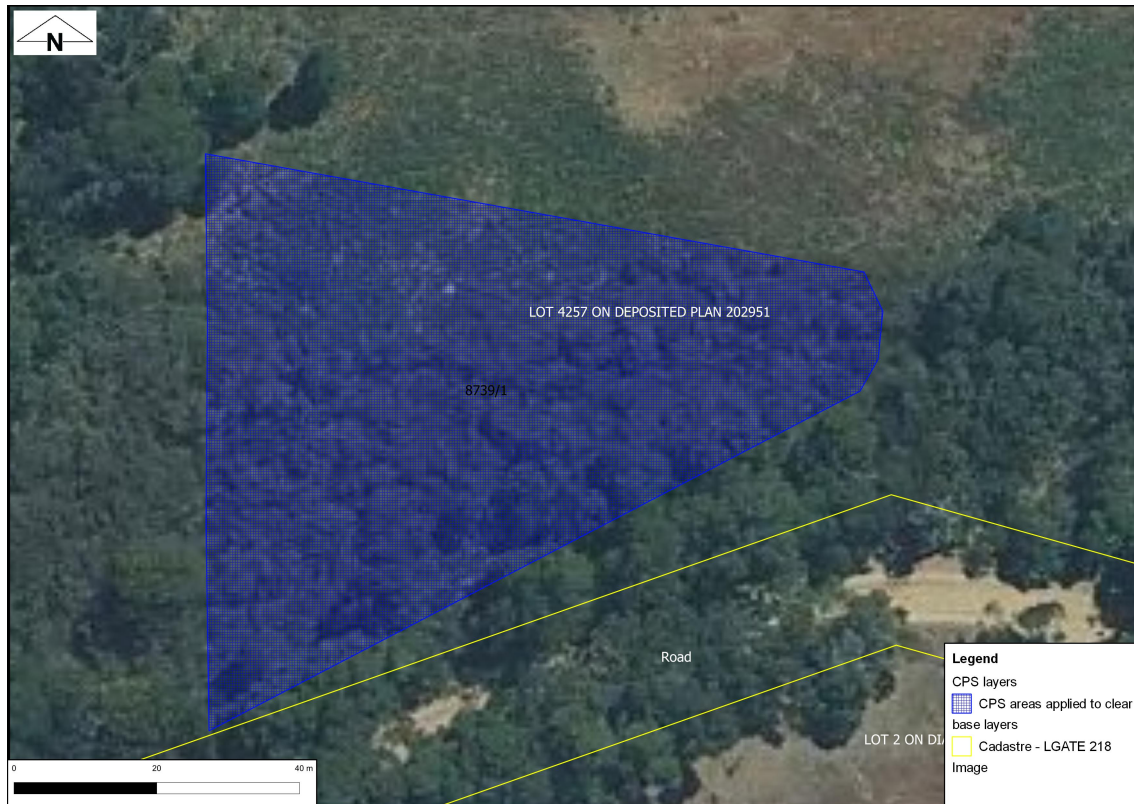
Figure 1: application area

The local area referred to in the assessment of this application is defined as a 10 kilometre radius measured from the perimeter of the application area.